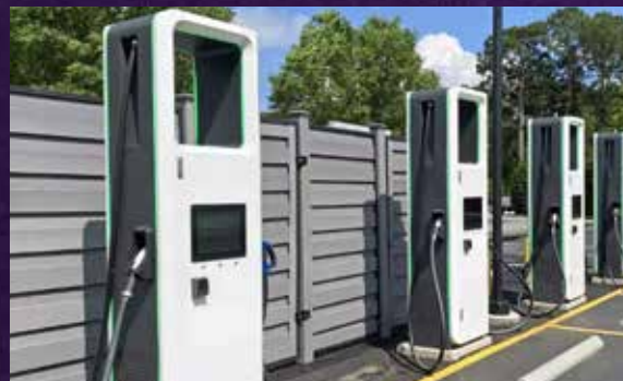
EV CHARGING POINT