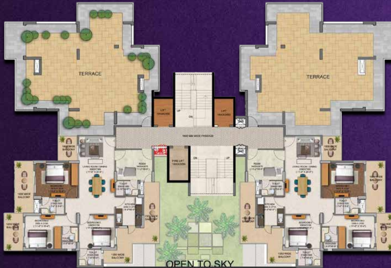
12th FLOOR PLAN (BLOCK-B)