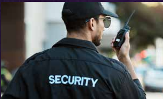
24X7 POWER BACKUP