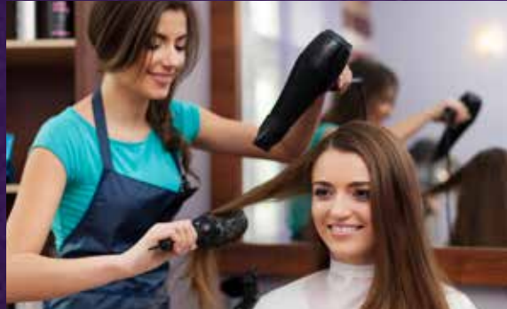
SALON & SPA